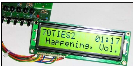
Shown with large LCD