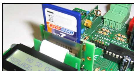
Shown with vertical SD card holder