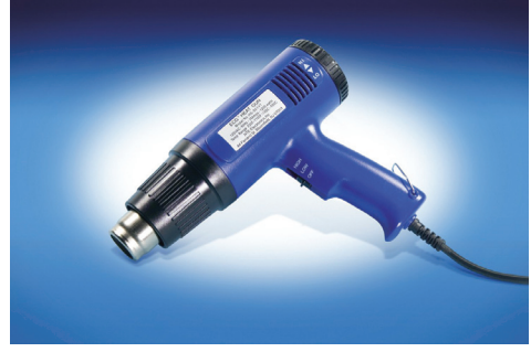
Compact, lightweight, easy to use.